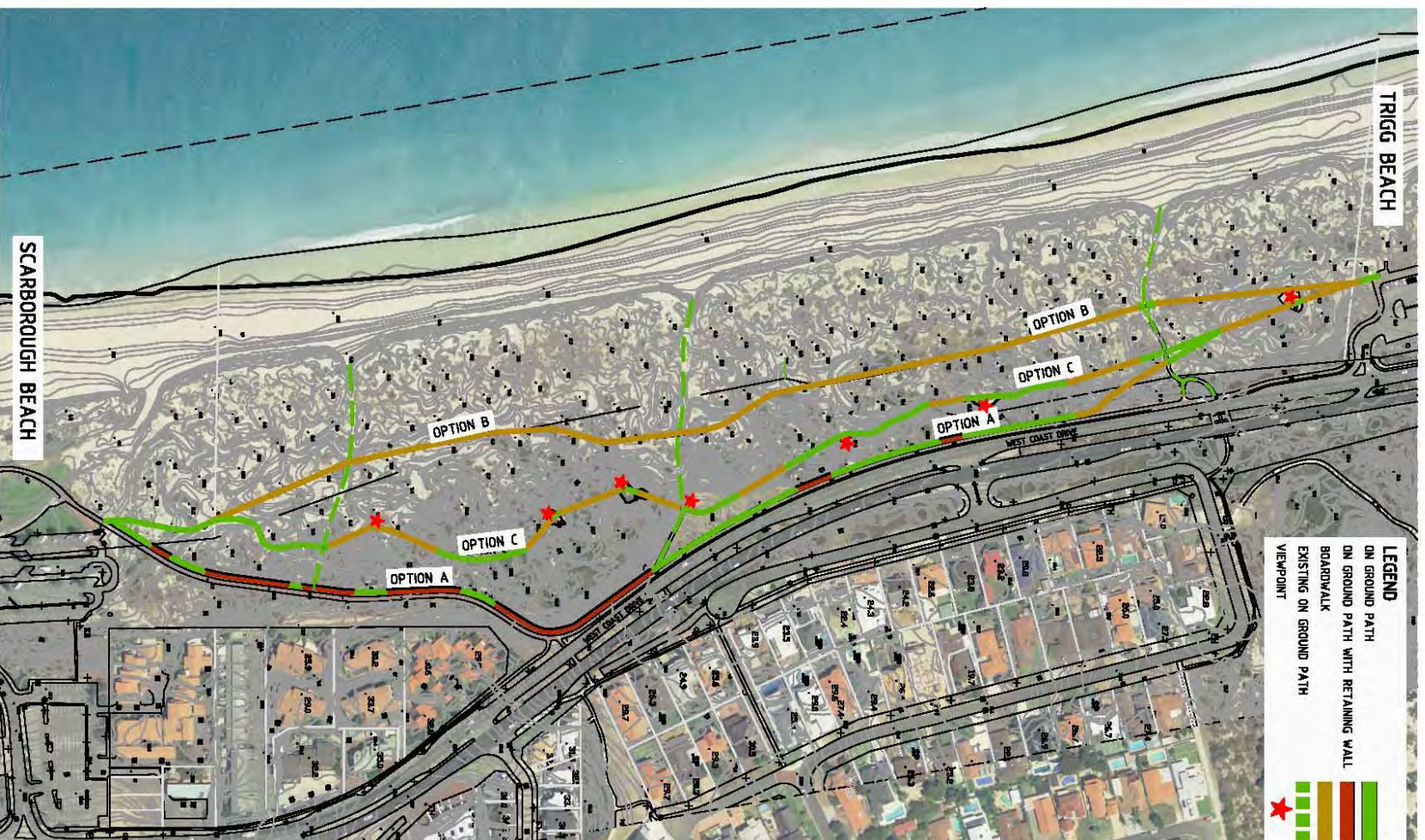
Attachment 3 - A4 concept plan (low resolution) showing the three (3) options